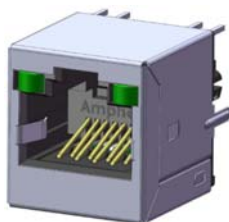
P/N RJE45/4A-188-1XX1 SHOWN SINGLE PORT, 8 POSITION, WITH SHIELD AND LEDs CAT6 / CAT6A