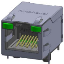
P/N RJE58/59/60-188-5XX1 SHOWN SINGLE PORT, 8 POSITION, WITH SHIELD AND LEDs CAT5e / CAT6 / CAT6A