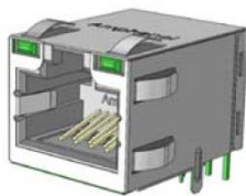
P/N RJE1A/1B/1C-188-5XX1 SHOWN SINGLE PORT, 8 POSITION, WITH SHIELD AND LEDs CAT5e / CAT6 / CAT6A